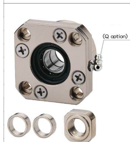
Electroless Nickel Plating(Application : Clean room)