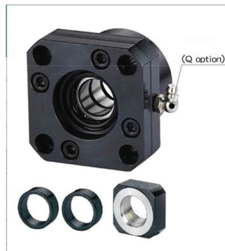
Black Oxide(Application : General case)