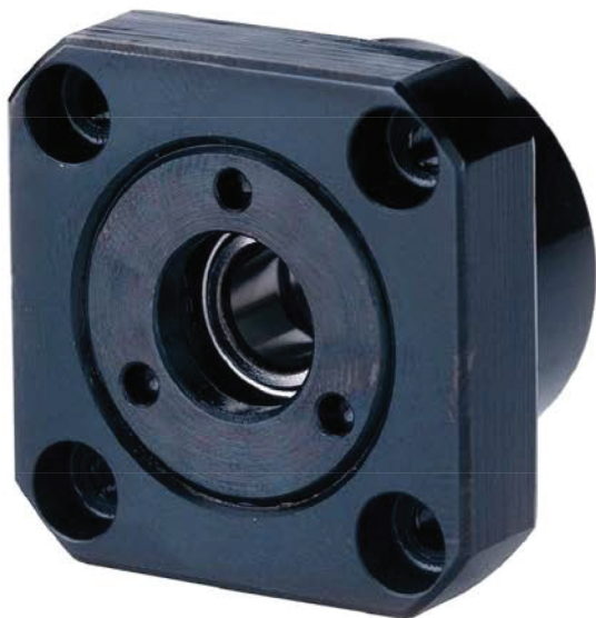
Support Unit FK (fixed-side round type)