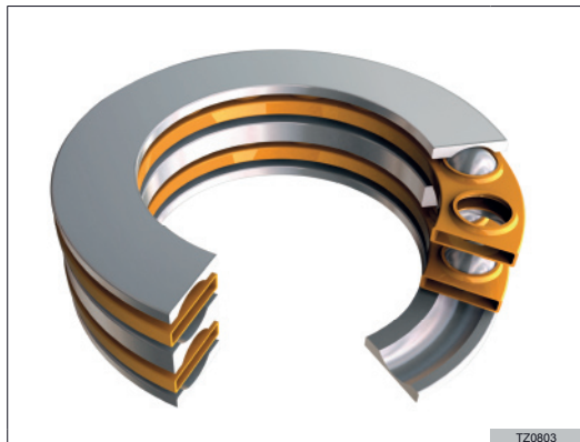
Fig.34 Double-row double-direction thrust ball bearing

Single-direction bearings carry axial load in one direction, and double-direction bearings carry axial load in both directions.