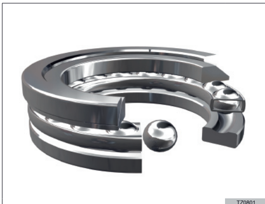
Fig.32 Single-row single-direction thrust ball bearing with a spherical washer

If the washer is an individual part, we quote U2..or U3.. and then the symbol of the inside diameter, e.g. a bearing with a washer: 53209 U , a washer alone: U209 .