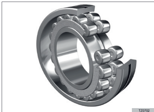
Fig.31 Double-row spherical roller bearing

Cages stamped from steel sheet are the most popular among spherical roller bearings, especially in small-sized bearing types. In bigger bearings solid steel or brass cages are implemented. There are also custom-made spherical roller bearings with cages made of polyamide strengthened with glass fiber.