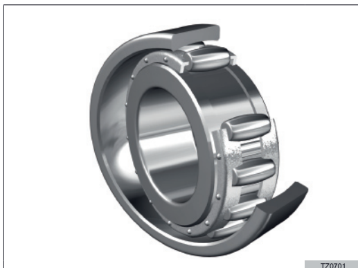
Fig.30 Single-row spherical roller bearings

Spherical roller bearings are inseparable self-aligning bearings designed for supporting heavy and combined loads. Single-row spherical roller bearings have one row of spherical rollers, spherical track of the outer ring and one track of the inner ring, whereas double-row spherical roller bearings have two rows of spherical rollers, spherical track of the outer ring and two tracks of the inner ring. They are made with a cylindrical bore for mounting directly on the shaft or with a tapered bore of 1:12 taper (K) for mounting on adapter sleeves or withdrawal sleeves. 240- and 241-series are manufactured with a tapered bore of 1:30 taper (K30) and mounted on sleeves of the same taper. The key feature of most of the spherical roller bearings is a lubricating groove and three lubricating holes on the outer ring, most often marked with the W33 symbol.