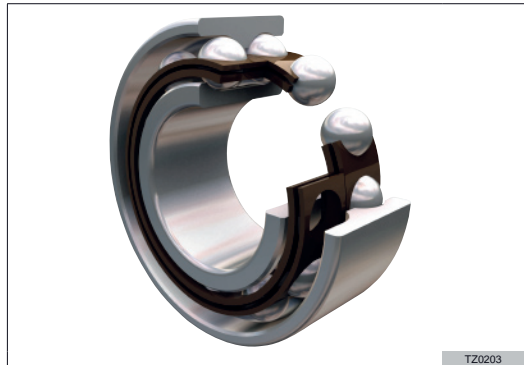
Fig.8 Double-row angular-contact radial ball bearing, opened version