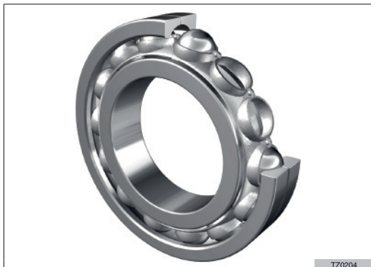
Fig.9 Single-row angular-contact double-direction radial ball bearing with a split inner ring, Q-type