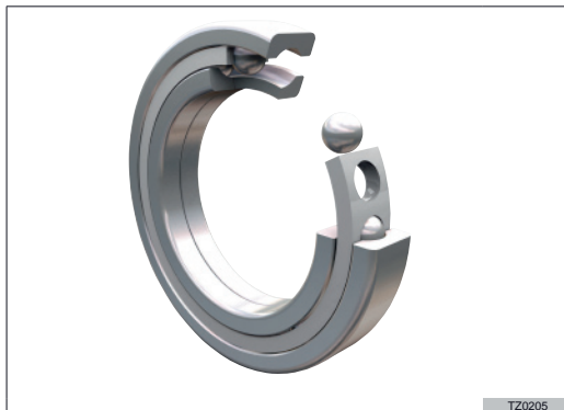
Fig.10 Single-row angular-contact double-direction radial ball bearing with split inner rings, QJ-type