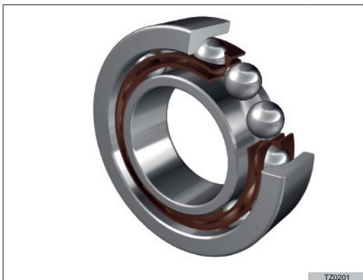
Fig.6 Single-row angular-contact radial ball bearing

The basic feature differentiating angular contact ball bearings from regular ball bearings is a different construction of the inner guided track of the outer ring. The track is positioned axially in one direction. Owing to that fact such bearings can carry considerable axial loads exactly in this direction.