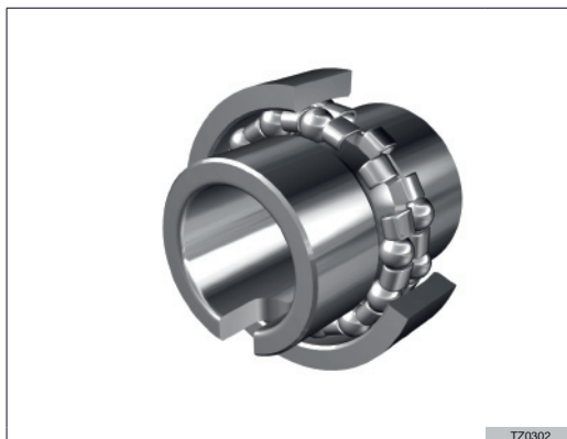
Fig.12 Self-aligning radial ball bearings with the extended inner ring

Specific features, relatively simple construction, easiness of mounting and dismounting are the reasons why the self-aligning bearings are applied in nearly all industry branches. They are especially recommended in applications where misalignment may increase through the shaft deflection or assembly errors. Bearings with wide inner ring are applied in ungrinded shafts in the first place.